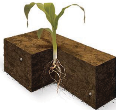
TYPICAL GRANULAR MICRONUTRIENT