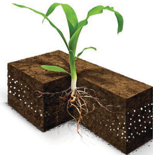
WOLF TRAX DDP COATED ON EVERY GRANULE