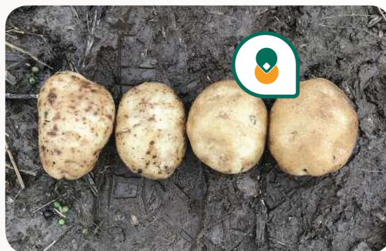
An in-furrow treatment of AZteroid FC 3.3 and starter fertilizer significantly increases uniformity and marketable yield compared to starter fertilizer alone.

Average yield increase across all trials = 20.4 cwt/ac